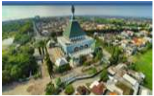
Fig. 21. Modern Post Modern Architecture Style

The influence and role of GiriKedathon Palace in economicaspect can be proved by the strength of the trading fleet and the current market of Nyi Ageng Pinatih market. This continuity strengthens the ability of the supply of goods for the people of Gresik city and the sale of agricultural products well. And a growing modern markets to complement the demands of diverse community needs. As in Figure 22-25