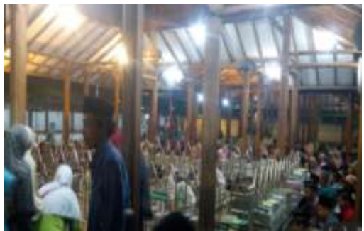
Fig. 9. The atmosphere of the tomb of SunanGiri that never deserted