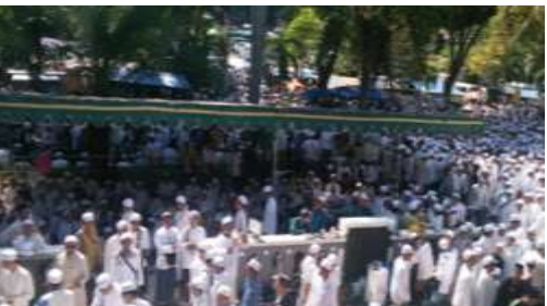
Fig. 18. Haul Auliatradition conducted by local people every year

Spirit of The Place to this day can still be found on the form of community activities that are inspired by the teachings of Giri as king Satmata, While the arrangement of Giri work center area, it is realized or not still visible duplication in the area pendopo and the regent office area characterized by The central government building and the mosque. As well as the orientation of urban arrangement of the hierarchy that feels placing the Giri area as the axis of the city of Gresik arrangement, as shown in Figure 4.5.6