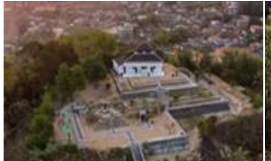
Fig. 13 . Image Lay Out artifacts foundation Istana GiriKedhaton Palace

The GiriKedaton palace site is located in DusunKedaton, Sidomukti Village Village, Kebomas Sub-district, Gresik and at the top of a hill at an altitude of 200 meters above sea level (GPS -7.17336, 112.63409). GiriKedaton site located about 500 meters from the tomb of SunanGiri in the history of the book Babat Gresik.