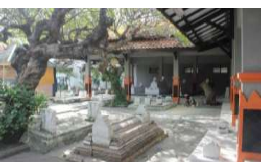
Fig. 6. Tomb of NyiAgengPinatih, whose trade relations are almost evenly distributed to all corners of the archipelago