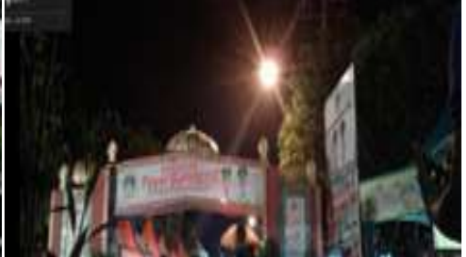
Fig. 25. Kemasan Market in the town