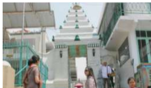
Fig. 11. Detailed Mosque Gate Ornament that combines elements of Majapahit Hindu building which became the teaching of the majority of the previous society.