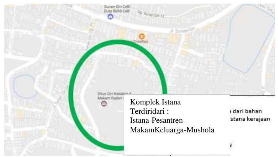
Fig. 19. Map Location of the palace complex

Meanwhile, to measure the sustainability of Islamic Nusantara culture using city development data from time to time by looking at the level of Persintence or the level of sustainability of the role and the existence of objects of artifacts of central government architecture. In every area of government, there are also mosques whose activities are oriented towards the Ainul Yaqin mosque, besides the mosque is always present as a landmark built in the city of Gresik, among others, residential areas, industry, trade and others. As in figure 7