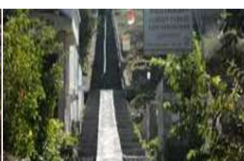
Fig. 14. Walk up to GiriKedaton Palace