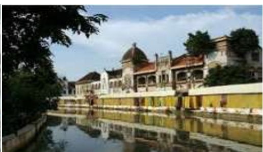
Fig. 12. The emergence of VOC activities and colonial buildings in the 17th century as a sign of the diminishing power of GiriKedathon kingdom.