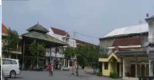
Fig. 8. PonpesMambaussholihin, one of the boarding schools as a SunanGiri heritage that started the kingdom by establishing pesantren in Giri Kedathon