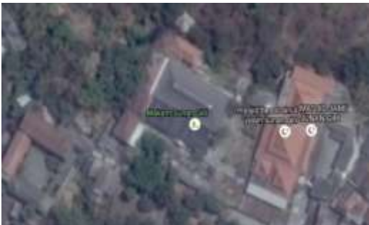
Fig. 10 .Photo images Ainul Yaqien Mosque complex and Sunan Giri Tomb complex built in the 15th century of Sunan Prapen's rule