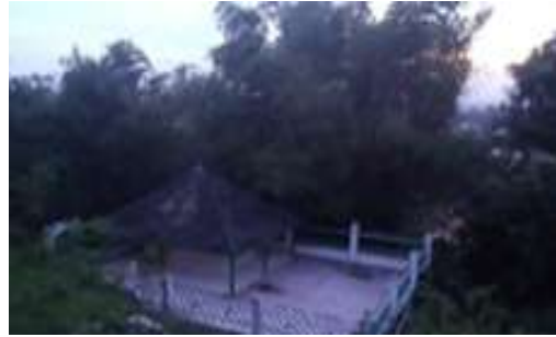
Fig. 15. Mosque in the Palace GiriKedaton