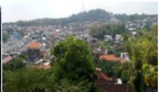
Fig. 16. The atmosphere of Gresik City residence from Istana GiriKedaton