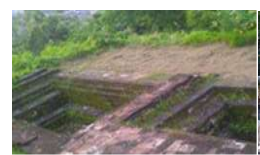
Fig. 17. Relics of swimming artifacts for the santri bath