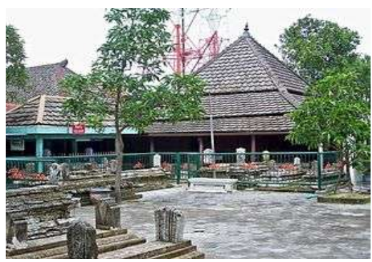
Fig. 3. The tomb of SunanGiri becomes the magnitude and strength of this region, which is crowded in the visit almost every time.