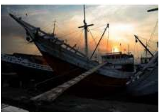
Fig. 4. The strength of Giri's one trade fleet is owned byNyiAgengPinatih who is none other than adoptive mother SunanGiri