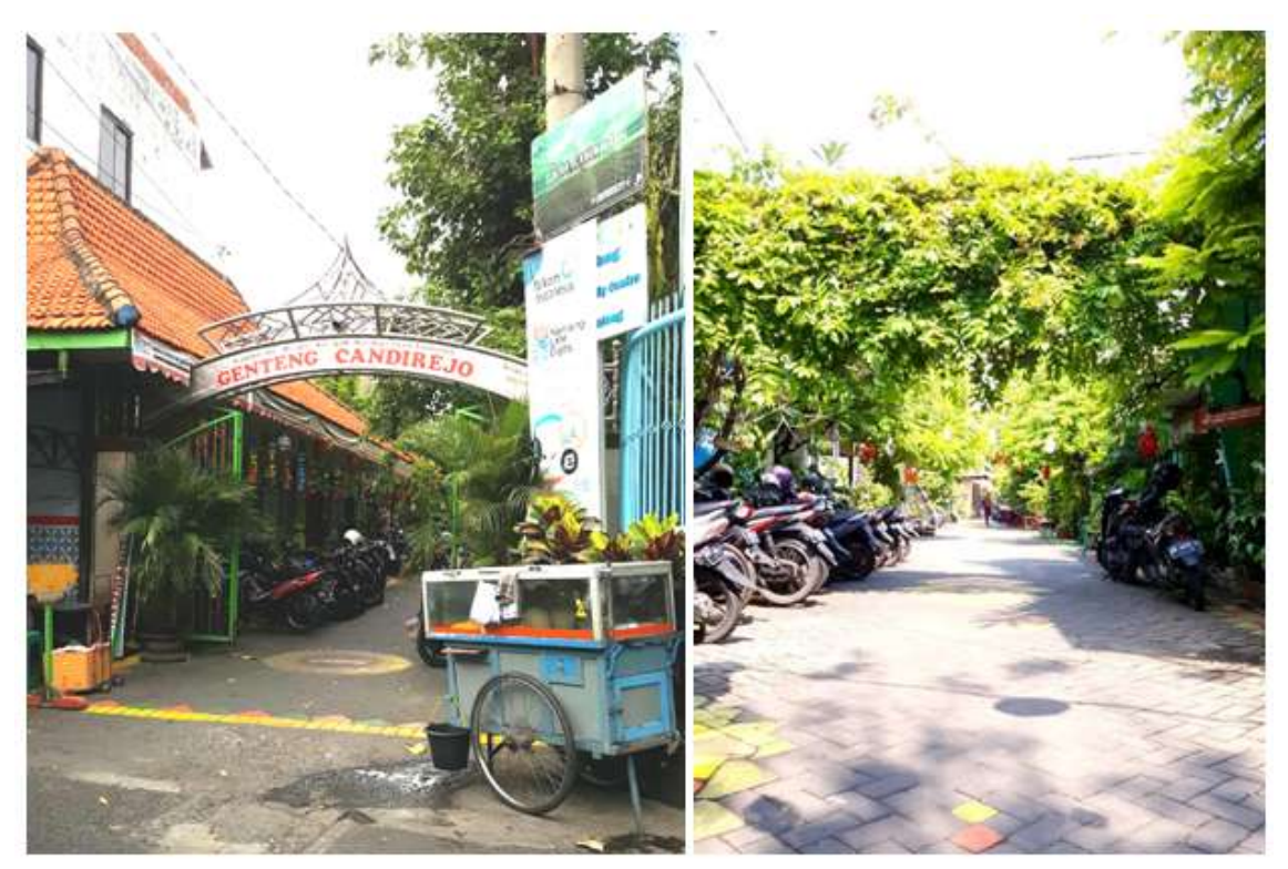
Figure 3 Parked motorcycle at the entrance area

Supported by title of Safe Kampung, claiming that this kampung is free from crime and violence, entrance area of Kampung Genteng Candirejo used as motorcycle parking area for public during the day (Figure 3). This place became a source of income for the keeper.