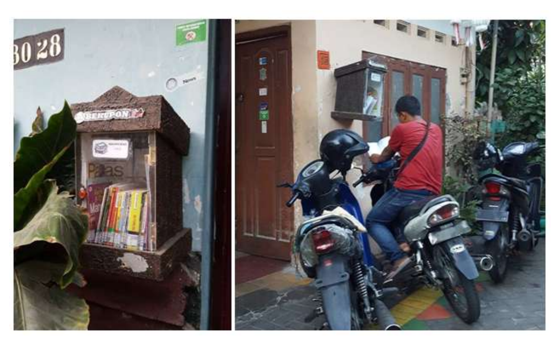
Figure 5 Free access bookshelves located throughout the kampung

The most distinctive environmental improvement is seen on lush vegetation throughout kampung. There are several mini gardens and ponds located inside the kampung. A green house (Figure 4) also established does not only to cultivate several kinds of plants but also become a place for children to learn about gardening. Each household is responsible for environmental hygiene.