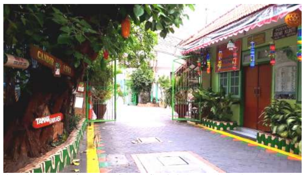
Figure 2 Front gate of Kampung Genteng Candirejo

Community spaces in kampung are improved. One of them is Balai or community hall. This place claimed as the centre of this kampung.