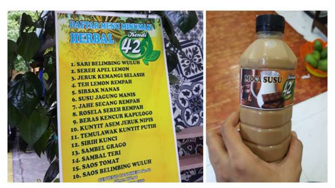
Figure 6 Mrs. Wita's UKM Brand and product sample

Mrs. Wita, as well as other member of UKM did the whole process of production on their own—from obtaining the ingredients to marketing process, and, for some, even the distribution is done by themselves. The nearest traditional market is the main source for most members of UKM. It is caused by the small scale production which is highly dependent on orders received. Most of them do not have formal workers. Those who helped them often came from close circles; neighbours, relatives, or members of household. While this activity generates local economy and participation of the locals, it has downside that the payment and working time. With social assistance from facilitators during SGC, Mrs. Wita and other UKM members' product is certified with trading license.