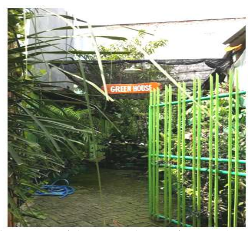
Figure 4 Green house located inside the kampung integrated with old tombs

Supported by title of Safe Kampung, claiming that this kampung is free from crime and violence, entrance area of Kampung Genteng Candirejo used as motorcycle parking area for public during the day (Figure 3). This place became a source of income for the keeper.