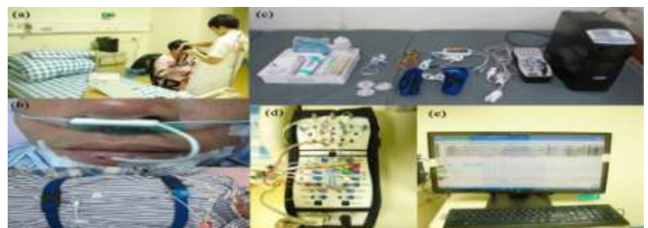
Fig. 1. Photos of the clinical experiment: (a) expert pasting electrodes on subjects; (b) sleep-breathing monitoring of subjects; (c) experimental equipment list; (d) channel list of Alice 5 PSG, Philips, Inc.; (e) PSG computer monitoring screen.

In this experiment, the sampling rates of EEG, EOG, and EMG were all 500 Hz. A higher sampling rate will reduce the speed and efficiency of the algorithm, so the sampled signal is down-sampled by 250 Hz in order to reduce the computational complexity of the data. The Figure 2 showssome of typical PSG recordings indicating various sleep stages, respectively.