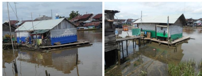
Figure 2. Lanting house frontage from the land