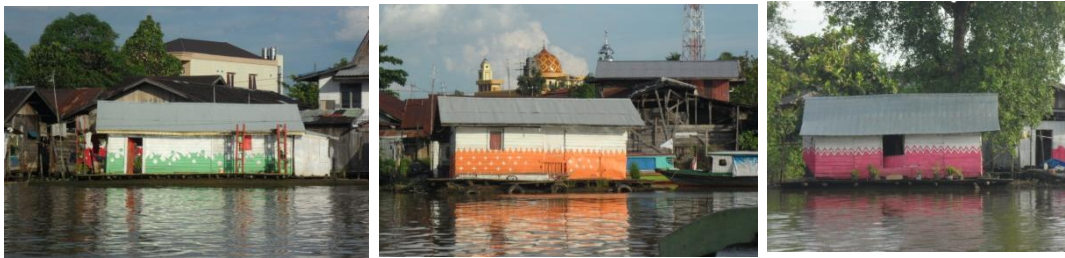
Figure 1. Lanting house frontage from the river

Lanting houses can be accessed from the river and from the land. Because of the rapid development of roadways in the city of Banjarmasin, the lanting house then more accessible by road. To go to the lanting house, using a wooden footbridge, the path is composed of boards with pole construction. Lanting house frontage from the river and the land is showed in figures 1 and 2.