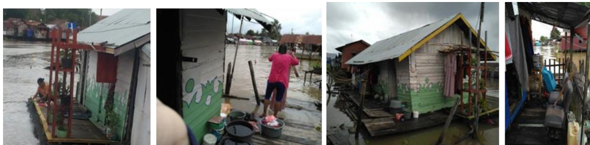
Figure 5. Domestic activities on the terrace of lanting house

Differences in the use of space can be known from the settings formed by semi-fixed and non fixed elements. Domestic activities that take place on the terrace, forming various settings according to activities and supporting elements, namely dishwashing setting, clothes washing setting, bathing settings, clothes drying setting and relaxing setting. When dishwashing and clothes washing, equipped with semi-fixed element in the form of buckets/water basins. Similarly with bathing, will be equipped with semi-fixed element in the form of scoops and soap containers. The lounge area is equipped with benches. The dishwashing activity is closed to the kitchen, while clothes washing and bathing, being free along the terrace where the inhabitants desire. The settings formed on the terrace are flexible in accordance with the activities undertaken and the existing semi-fixed elements.