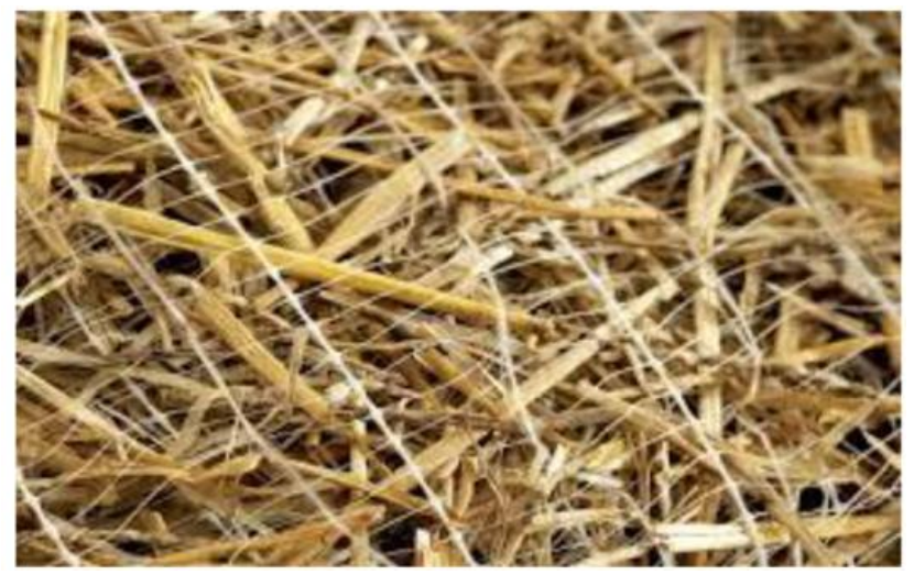
Figure 3: Wheat straw blanket

Like coir blankets, straw blankets are designed for slope erosion protection and furnished vegetation growth. They are used to hold soil in place and promote the growth of new vegetation and on all types of slopes. Straw blankets prove extremely effective in retaining moisture and contouring to soil surface irregularities. Straw blankets help prevent and control the natural displacement of soil in areas such as slopes, hills, channels, streams, rivers, and coasts. It prevents loss in NPK nitrogen, phosphorus and potassium present in fields.