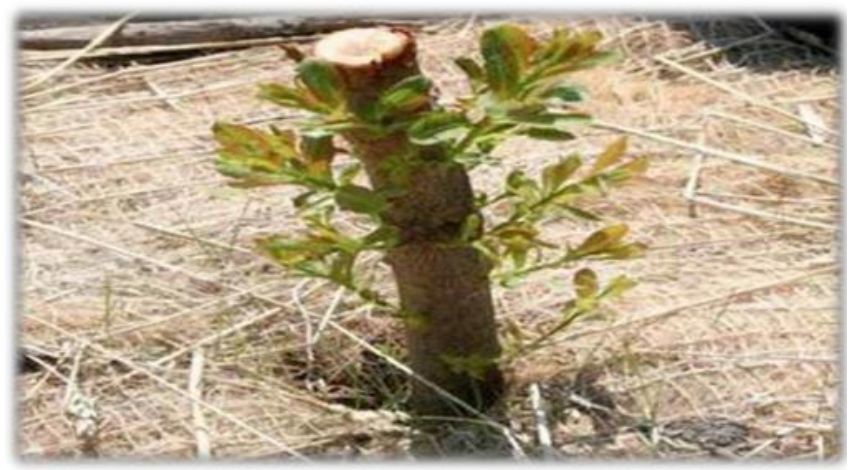
Figure 1: Coir Blanket

Soil erosion is one of the major problem which is increasing and needs an economic solution. In several slope, steep areas and various land forms protection methods are currently used to stabilization. Among these methods, the use of naturally obtained products is popular. But apart from all this measures coir blankets were successfully used as an erosion control measure, and to make it more economic and totally biodegradable. We are implementing a new measure for controlling soil erosion through rice straw blanket.