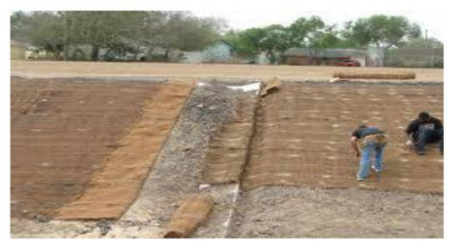
Figure 2: Blanketing technique