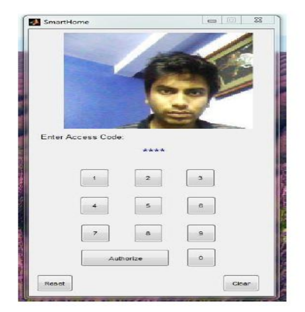
Fig 2.2: Real Time Security System, Developed Using GUI.

The security system is designed using the MATLAB GUI platform. A security system consists of a portable panel consisting of pushbuttons, a LCD screen and a camera. On start up the system requires a 4 digit password which was previously set up by the user. If the entered password matches the previously set up password then Matlab sends an affirmative message to the Arduino via USB cable so the door opens and the entire smart home system turns ON. If the password does not match, then the camera captures an image of the intruder and saves the image in the system and also e-mails the image to the user and the door remains locked.