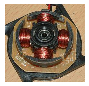
Fig.2.4 four pole bldc motor

The four poles on the stator of a two-phase brushless motor. This is part of a computer cooling fan; the rotor has been removed [4].