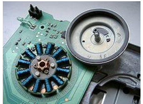
Fig.2. Brushless DC electric motor with floppy disk drive

The motor from a 3.5" floppy disk drive. The coils, arranged radially, are made from copper wire coated with blue insulation. The rotor (upper right) has been removed and turned upside-down. The grey ring inside its cup is a permanent magnet.[1]