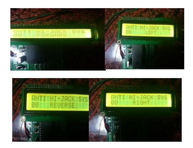
Fig.5 control signals from the base station

From then the control of the aircraft is transferred to the base station. The corresponding movements are seen of the LCD display at the base station. (Fig.5)