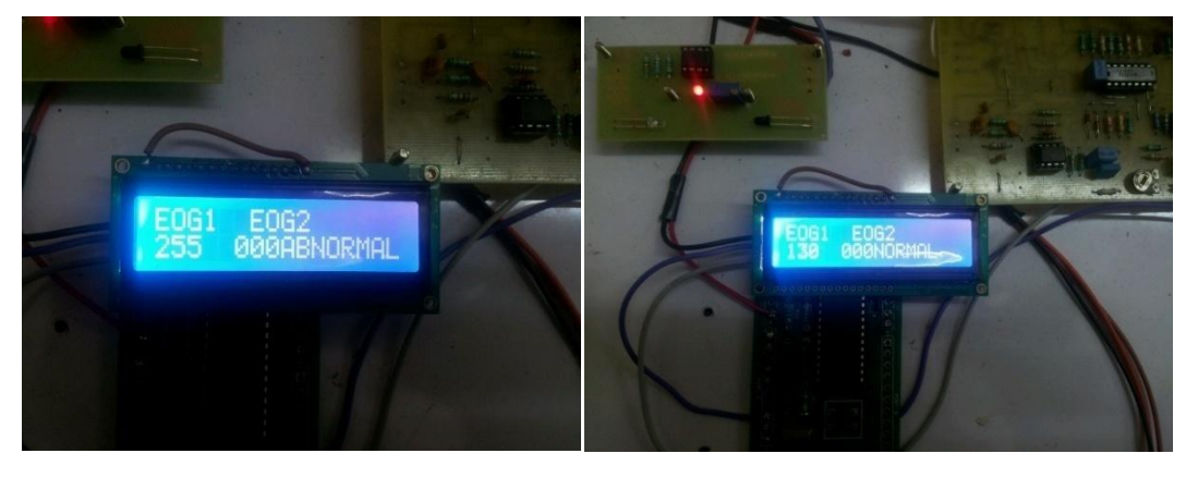
Fig.4 Normal and abnormal signal detection at the base station