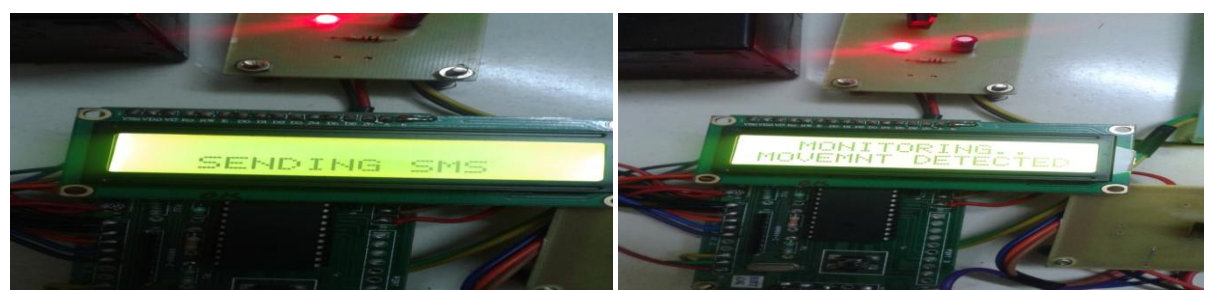
Fig 2 (a) Sending SMS to the mobile number

Automatic Park and retrieve assissted systems for automobiles using smartphone