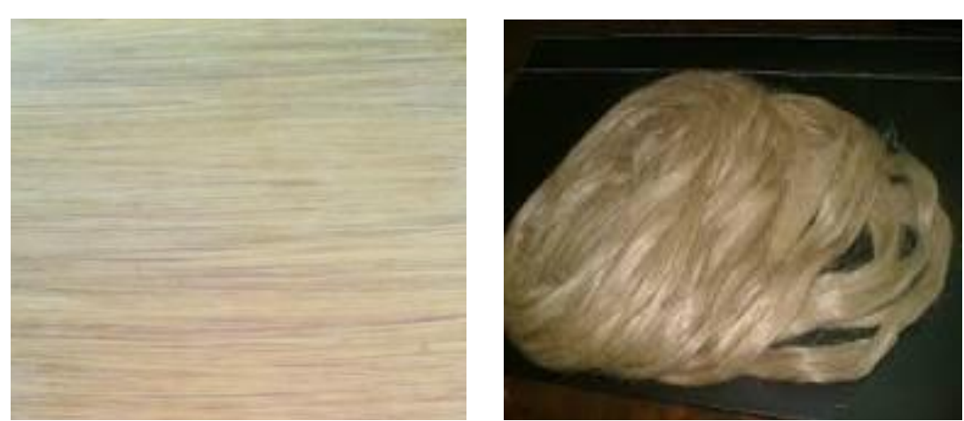
Processed fibre composite