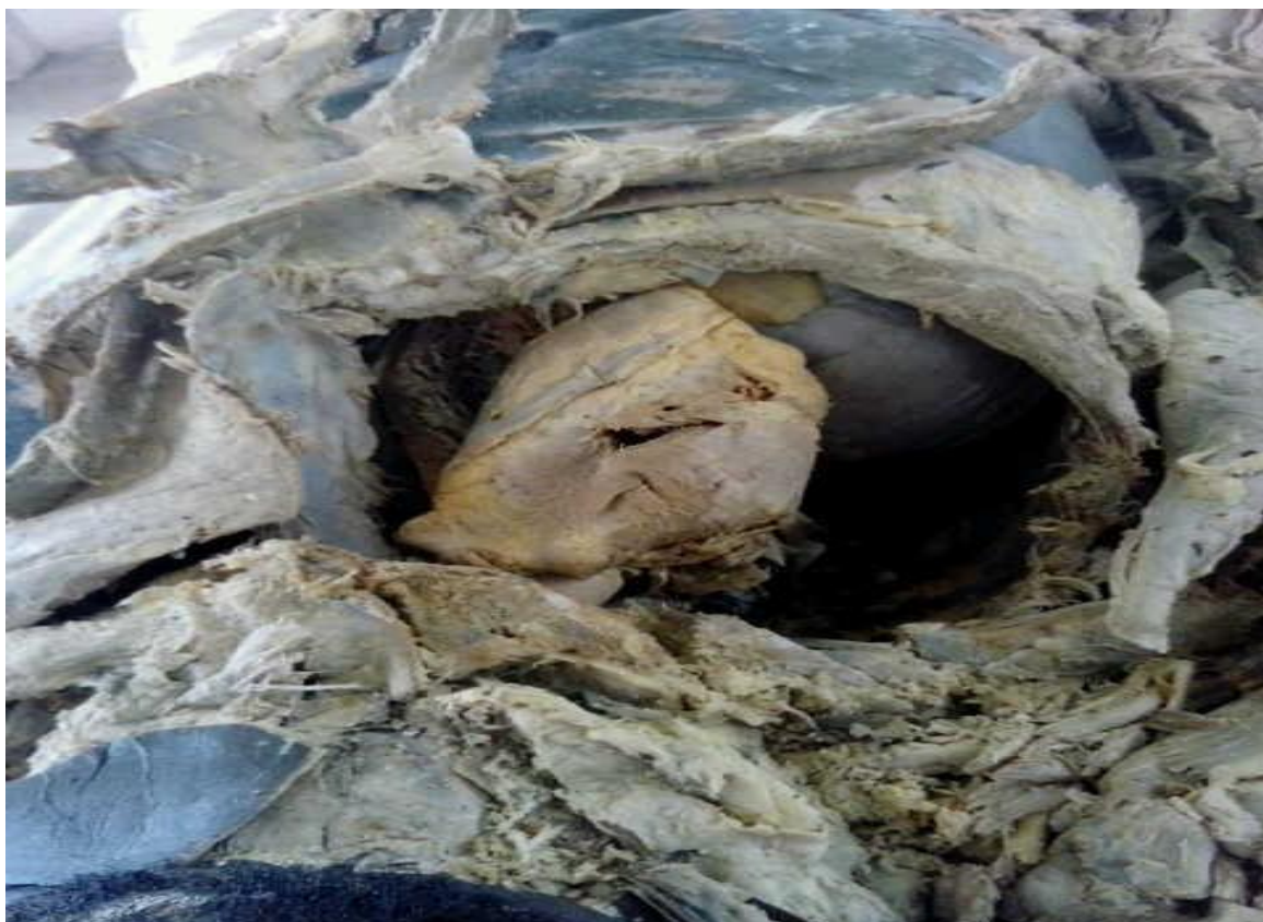
Fig. 2. Superior view of the thoracic cavity in situ. Note the superior aspect of the right lobe of the liver.