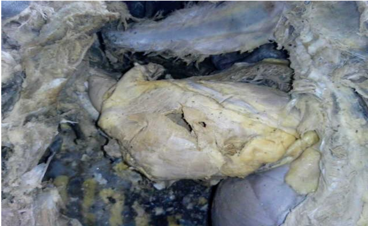
Fig. 3. Lateral view of the thoracic cavity in situ. Showing the heart and part of the liver.