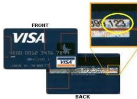
Figure 1, security on a Visa Card

Credit card security code is one the information needed to authenticate online transactions. It is important to secure our security code since it is a safety feature, just like PIN number. You can only provide it during online transaction when the connection is secure. Never provide it through E-mail, since it is unsecure connection [10]. As long as someone has your card number, security code and card expiration, it will appear to the merchant that he is the right owner. The location of the security code on a card depends on the type of card. For cards like Visa, Master or Discover, it is the last three digits of the series of digits on the signature box, located at the back of the card. From the Visa card displayed below, the circled number, 123 is the security code.