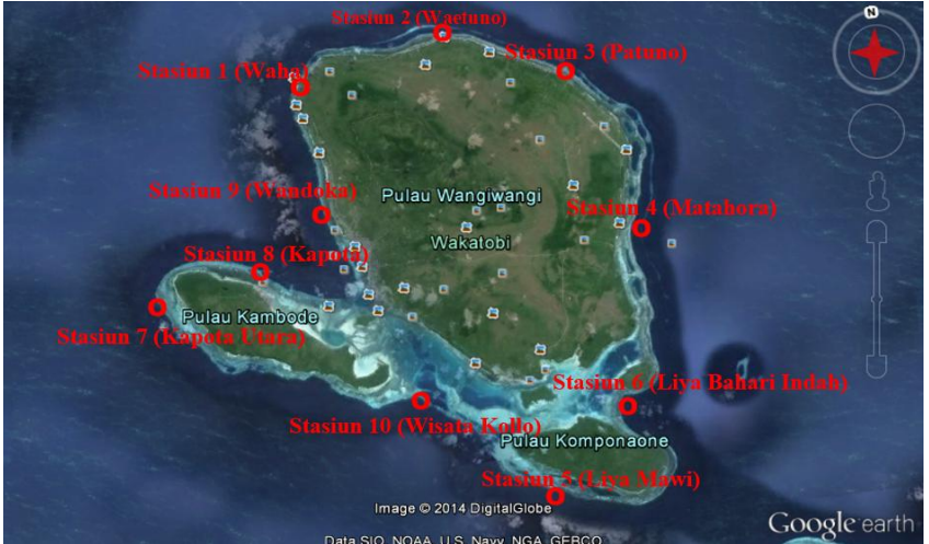
Figure 1. Position of Wangi-wangi Island Observation Station