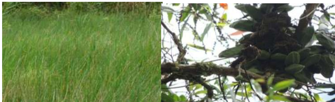
Eleocharis dulcis Dischidia rafflesoawa