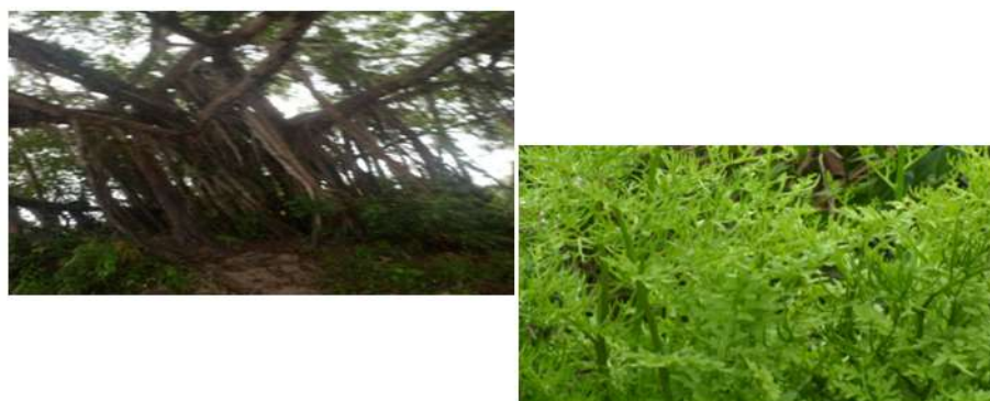
Ficus pisocarpa Ceratopteris thalictroides