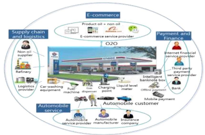
Figure 4 Ecosphere of Smart Petrol Station

Based on the operation ideas of "people, vehicle, service", drawing on the internet thinking, relying on the integration of supply chain and logistics, automotive services, payment and finance, e-commerce and petrol station service, we build the ecosphere of smart petrol station, and realize the comprehensive transformation and upgrading of petrol station business, which is shown in figure 4.