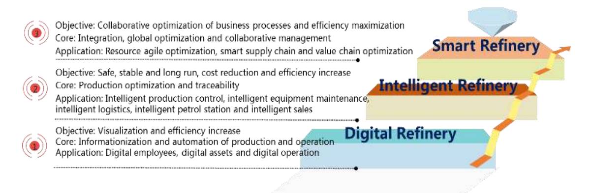
Figure 1 Construction Plan of Smart Refinery

Digital refinery is the foundation. The core application of digital refinery is the digitalization of human, equipment and operation, with process automation and management informatization. Through the digital refinery construction, the visualization of the factory operation will be realized, and the management efficiency of the production and sales will be improved.