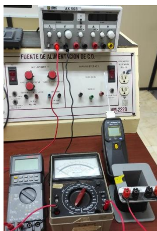
Figure 2. Assembly and connection of measuring instruments and other devices

In figure 2, you can see the image that shows the physical arrangement of the measuring instruments, the power supply and the inductor.