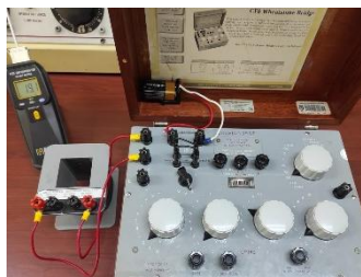
Figure 3.Measurement, PW

In order to validate the procedure and its respective result, the ohmic resistance of the inductor was measured with a Wheatstone Bridge ( PW ) -figure 3-, the result of the measurement is indicated in table 6, as well as the calculation of the relative percentage error, taking the PW reading as a reference -table 7-: