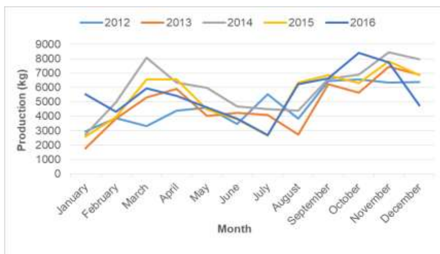
Figure 2. Production from 2012 to 2016

From the table and figure, the highest production occurred in 2014 with a production of 71,626 tons. Whereas the lowest production occurred in 2012 with a total production of 57,762 tons. Whereas for the month with the lowest production occurred in January 2013 with production of 1,764 tons and for the month with the highest production occurring in November 2014 with a production value of 8,456 tons. It can be seen that the month which has the lowest production is between December and January. This is caused by bad weather characterized by high intensity rain, strong winds so that the waves are large which causes fishermen to be reluctant to sea.