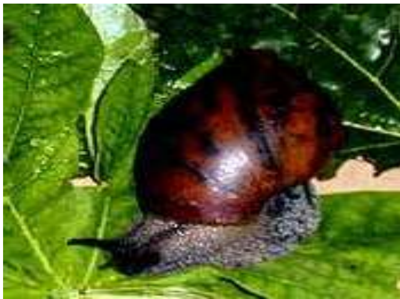
Figure 1- Achatinaachatina (big red)

The study focused on two species of Achatinidae: A. achatina (Fig.1) and Arch. ventricosa .(Fig.2).