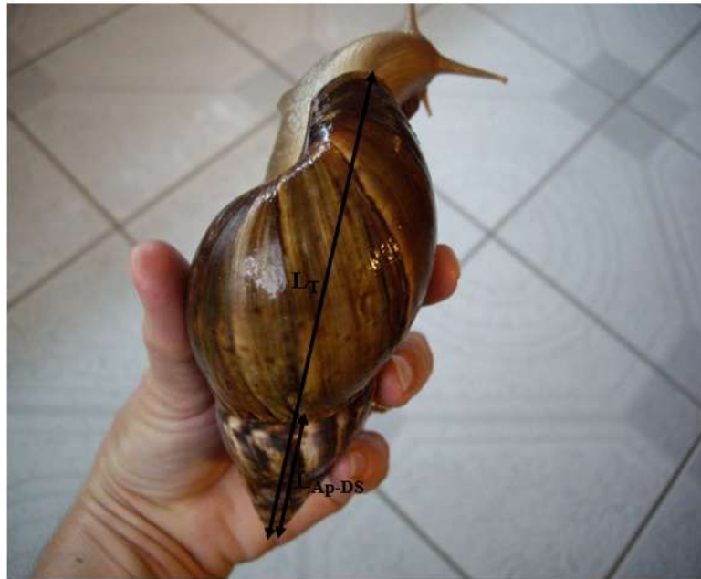
Figure 5: measurement of parameters associated with shell length