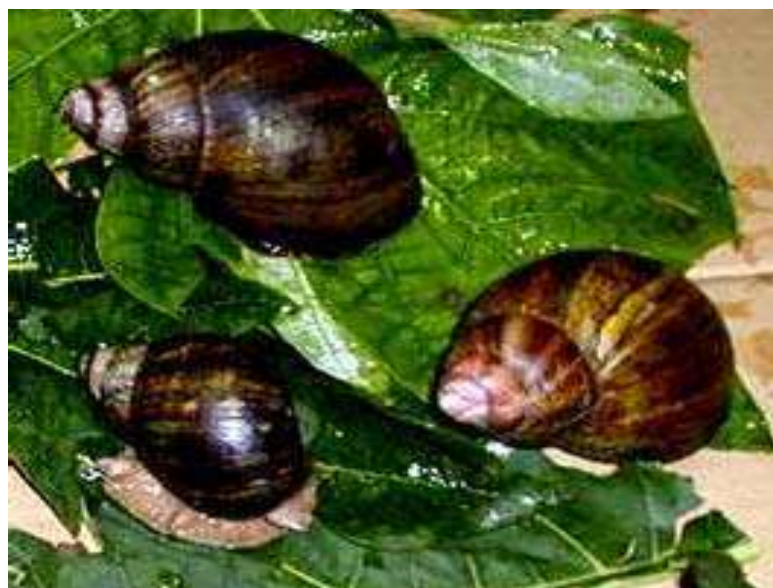
Figure 2- Archachatinaventricosa (big black)