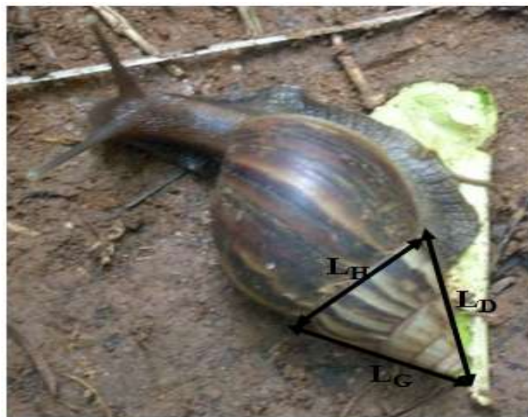
Figure 3: measurement of the sides of the apex