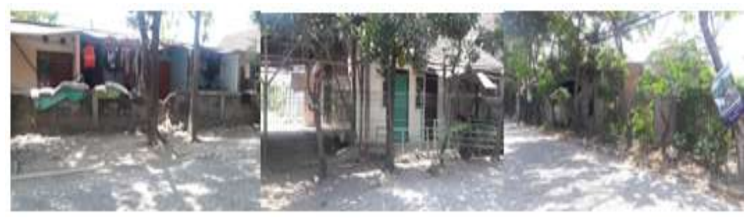
Figure 7 The existing condition of the boundary of the houses between the immigrant population and the indigenous population.

Analysis of sustainable social aspects is based on Basiago indicator (1999). The social aspect of sustainability is influenced by the basic character of the housing residents as immigrants. Although they come from different regions either from the city or from their village, they have similarity that they reside there only temporarily and more on the needs for work in which, most of them reside in big cities like Surabaya and Sidoarjo. Even though they live in the village, their lives are more characterized by urban lifestyles. This impacts their attitude in communication and interaction among citizens which is more practical urban, although the influence of rural communality pattern is strong enough in their social life. Details of evironmental indicators, potentials, and problems can be seen in Figure 7 and Table 4.3.