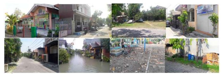
Figure 5 Conditions of existing problem on education facilities, health, open space, buildings, roads, floods and garbage.

Environmental aspect analysis is based on indicators according to Morelli, (2011). The core of housing residents consists of middle to lower, so the need of facilities is not too high. Facilities and infrastructure already exist, but not yet in good condition. This is evidenced by the many hindered of public facilities such as parks and fields that are not functioned properly. While the awareness of the citizens about the use of facilities and the use of materials in case of reuse and recycle appears instantaneously (only because there is a competition). Flood problems and lack of housing and environmental health requirements always arise due to lack of awareness of inhabitants regarding the importance of greenery (reforestation), the smooth flow of water channels, and the setting of road surface height. For details of evironmental indicators, potentials, and problems can be seen in Figure 5 and Table 4.1.