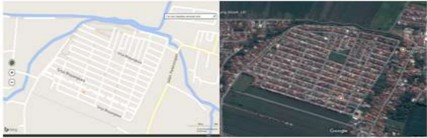
Figure 4: Griya Bhayangkara Housing Estate Map