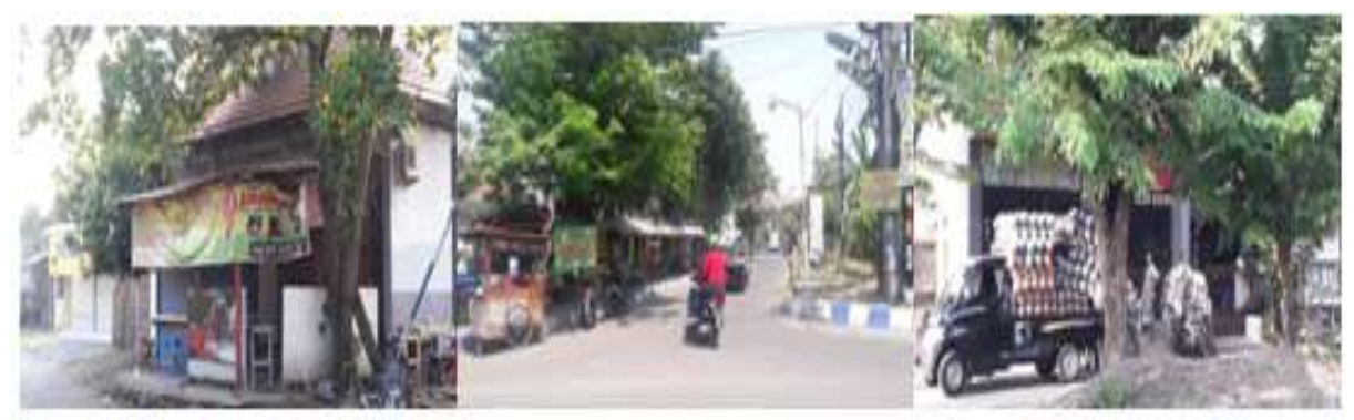
Figure 6 Existing conditions on trade facility problems and garden function in the residential area.

Analysis of sustainable economic aspects is divided based on indicators according to Basiago (1999). This housing estate is in principle built for the middle to lower class with the type of building 21 m^2 . This has consequences on the economic. This condition is seen in the livelihood of citizens who tend to be employees in companies in big cities such as Surabaya. To increase family income, some residents rely on small business by making home-based enterprise such as stalls, shops, haircuts, workshops, and so on which is placed in front of their house. Details of evironmental indicators, potentials and problems can be seen in Figure 6 and Table 4.2.