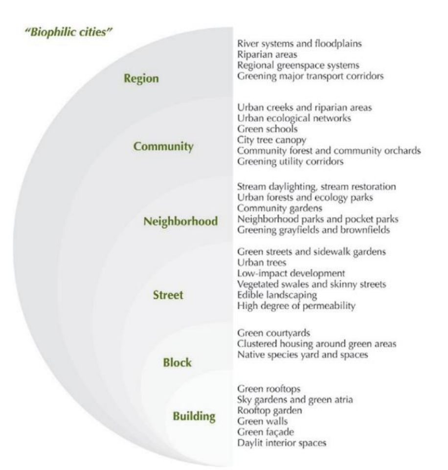
Figure 5. Biophilic green urban design elements in cities (Beatley, T., &Beatley, T. (2011))

The aim of biophilia is the integration of ecosystems into urban settings. From a psychological standpoint, nature offers individuals healing experiences to combat stress and mental exhaustion that enhance their state of health. From the standpoint of urban architecture, nature offers aesthetics, protection, and an awareness of place (Schmidt, S., &Németh, J. (2010)). Therefore, the integration between nature and urban architecture is the source of the complexity of biophilic design.