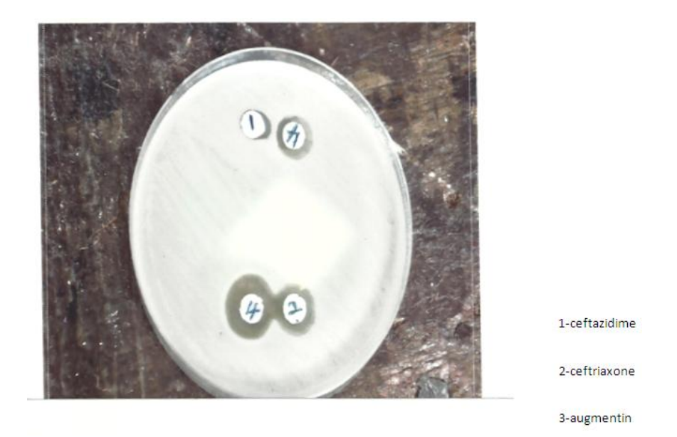
Plate 2:Synergyof Clavulanic acid (containing disk) with ceftazidime and ceftriaxone in Double Disk Synergy Test(DDST) exhibited in ESBL positivek.pneumoniae

Clavulanic acid inhibited the action of the ESBL produced by Klebsiella pneumoniae thereby making the zone of inhibition around disk 1(ceftazidime) and 2(ceftriaxone) on the area closer to the disk 4(augmentin ,which contained clavulanic acid) to augment towards disk 4 as shown in plate 2.