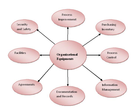
Fig 1.Responsibilities of Organization/Institute