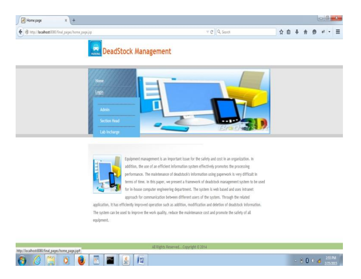
Fig 3. User Interface of Deadstock Management System

The user interface of Deadstock Management System is shown in Fig.3. The left side of the UI shows the working menu and the below is the brief description of system. It was designed by Jquery, JSP, HTML5 and users operate the function on their computer browser. Different roles (such as administrator, section heads and labincharge) have different authorities to open different functions.