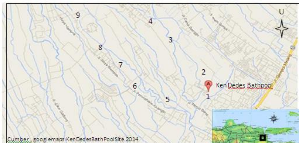
Figure 1. Location of Ken Dedes River