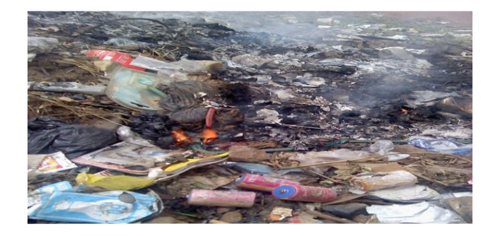
PLATE 1: An Open Dump Site with Hazardous Waste any Other Waste at Post Office Motor Park, Ilorin East Local Government Area.

Table 3, shows the combined population of ages of respondents between 11-40 years (88.83%) as the category of people mostly involved in hazardous wastes generation and management. Table 6, indicates that Torchlight/Phone batteries is the most Hazardous waste generated by the people 30.02%, due to its level of usage as a result of frequent interruption of electricity. Table 7, shows that 52.88% of the respondents are using waste bin for waste collection, due to the fact that waste bins are located at some specific spot along the road side of the metropolis. While 14.48% and 32.64% are using open ground and dump site respectively. This is due to improper specified location for dumping of Hazardous Wastes and lack of enlightenment about the menace of Hazardous Wastes. Table 12, shows that 6.63% of the respondents agreed to punctuality of municipal authority in the collection of Hazardous Wastes, while 93.37% disagreed vehemently, which is an indication that the municipal authority do not adhere strictly to their responsibility effectively.